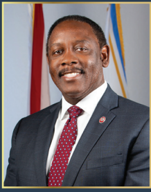
Orange County Mayor Jerry L. Demings